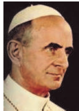
Canonization Oct. 14, 2018